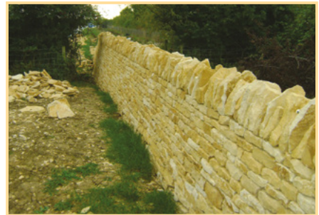
Bottom right: Building a curved section of wall.