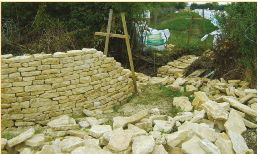
A field boundary wall in progress. Notice the stones in the foreground, already sorted and hand picked at the quarry, to give stones which are ready to use, easy to build with and less 'knocking off' required. Also notice in the background the Smiths' bulk bags. Delivered to site and situated ready for use.

Our walling stone is picked, prepared and hand selected into bulk bags and delivered to site in vehicles with crane off-load facilities. Bulk delivery of loose stone by our tipper vehicles can also be arranged.