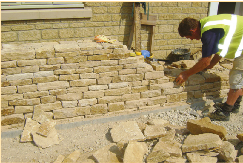
Left: Building a small property boundary wall on a new housing estate.

Smiths' Cotswold dry walling stone is very adaptable and can be 'cropped' and 'dressed' by tradesmen for use as a building stone for commercial and residential properties designed in the classic Cotswold style. All stone is sorted at source, with trained tradesmen selecting and preparing the stone before being delivered.